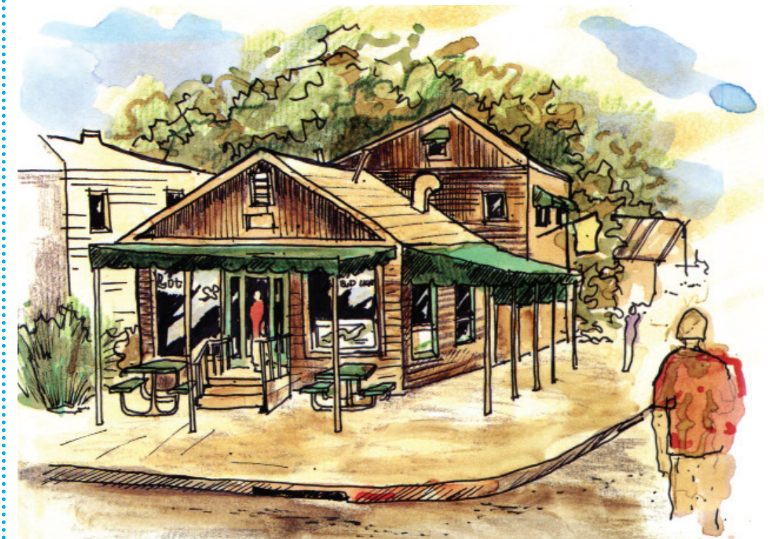
Art by Ginger Doyle

"Where there are no strangers, only friends you haven't met."